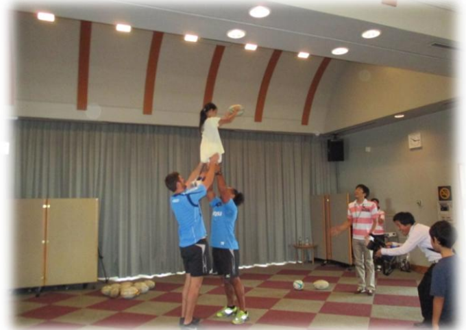
Higher in the air! after synchronizing the breathing with the lifters to receive the ball without being afraid of height.